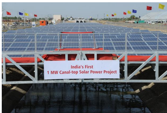
Figure 2. The solar panels on the Narmada canal.

A recent example of the innovative ideas is laying down of solar panels on the Narmada Canal, a recently constructed canal under Sardar Sarovar Dam to irrigate the Gujarat region. 37 This was innovative ideas as it will save the electricity losses that arise due to its transportation. The electricity generated by the solar panels will be distributed to the nearby villages and this would also reduce the long distance wiring costs. This scheme will save large area of land that would have been required for laying down of solar panels. The solar panels will reduce the water evaporation from canal. The cool weather of river will provide cooling to solar panels and thus help in continuous electricity generation for longer duration. 38 The first 1 MW electricity power plant set up over a 750 meter-long stretch of the canal, commissioned in February 2012, will generate 16 lakh units (MWh) of clean